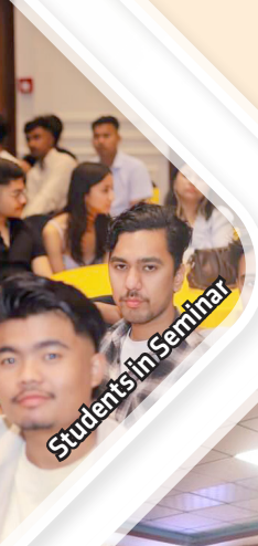
Students in Seminar