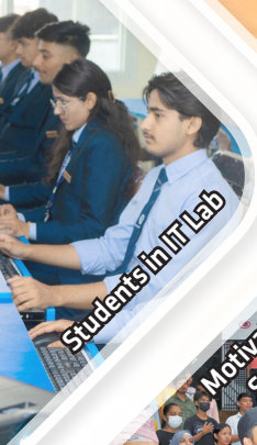
Students in IT Lab