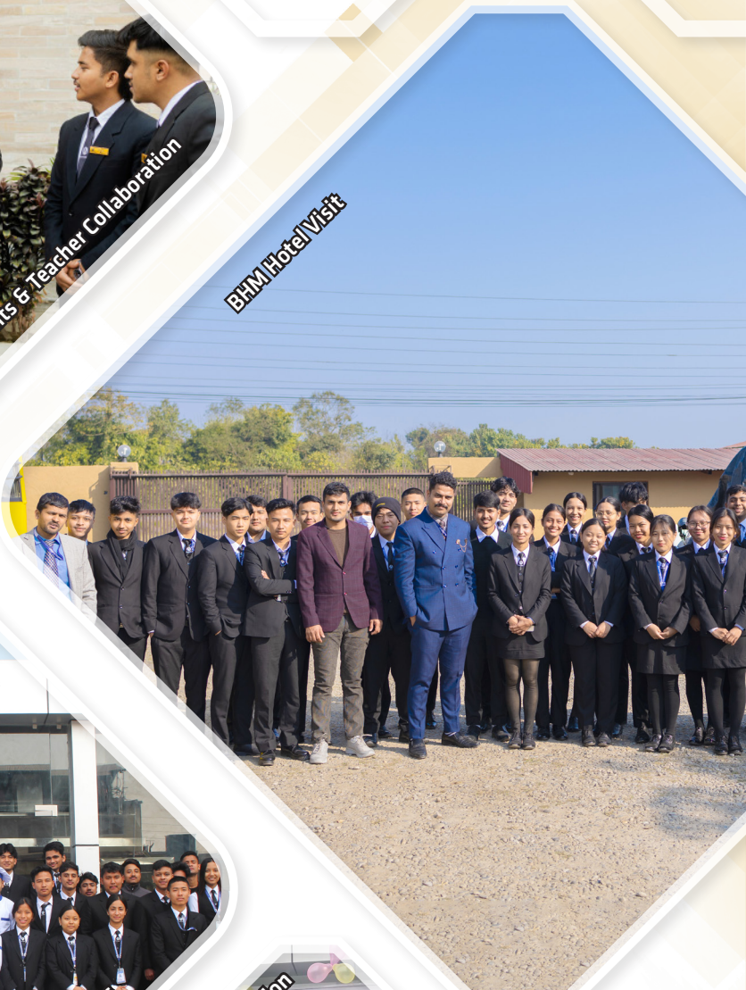
BHM Hotel Visit