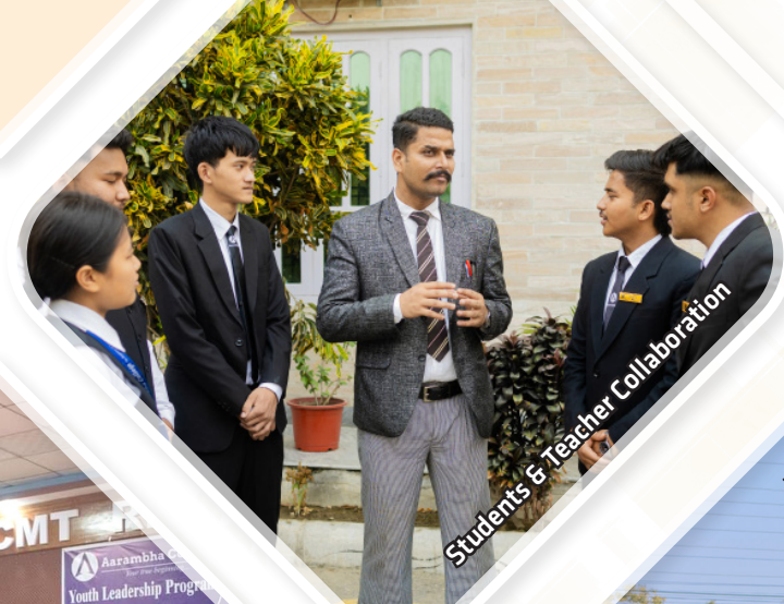
Students & Teacher Collaboration